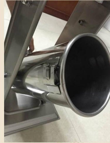
Push out the cylinder